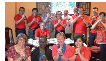
Indo-Menno group with MWC visitors in February 2016.

Jemaat Kristen Indonesia (JKI) – Indonesia Christian Congregations was formed in 1977 to provide an ecclesiastical structure for the Christian services carried out by the Sangkakala Foundation since 1977 in Semarang. The scope of ministry is in the form of evangelism, distribution of sermon recordings, vocal groups, bands, social services and on several occasions conducting Bible courses. Currently there are 223 local churches under the JKI synod and more than 40,000 members spread into 19 provinces in Indonesia, with a few congregations in the USA, Australia and the Netherlands.