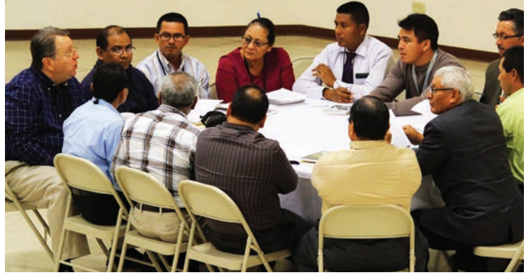
Brethren in Christ leaders from throughout Latin America discuss a variety of issues during a breakout session at the IBICA summit, held in San José, Costa Rica, in December 2013.