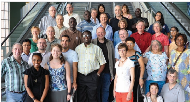
MWC leaders at a tour of the Farm Show complex in Harrisburg, Pennsylvania, USA, site of the 2015 assembly.