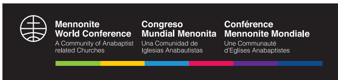
Full Colour Signature (White) Horizontal MWC_Sig_WHT_Horiz.ai MWC_Sig_WHT_Horiz.png