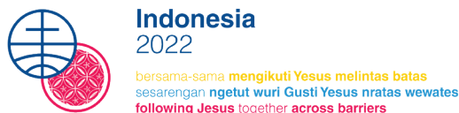
Indonesia 2022 Logo and Theme English MWC_2022_themes_logo_EN-01.ai MWC_2022_themes_logo_EN-01.png

There are several different graphics with different language options. Only these official options can be used. All official options can be found in the Dropbox folder.