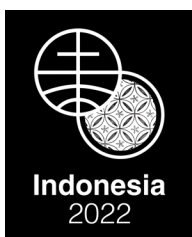
Indonesia 2022 logo (White) MWC_2022_logo_WHT.ai MWC_2022_logo_WHT.png