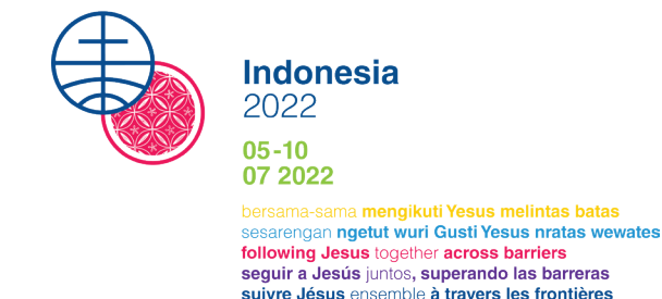
Indonesia 2022 Logo and Theme with Dates MWC_2022_Logo_Themes_Date.ai MWC_2022_Logo_Themes_Date.png

The theme for Indonesia 2022 Assembly is translated into 5 languages: Javanese, Indonesian, English, Spanish and French.