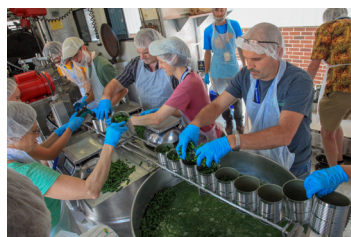
Many service opportunities.

Every afternoon offers an opportunity to learn, share and make friends. A wide array of tours, service projects and fun activities like the Anabaptist World Cup football tournament is lined up for you.