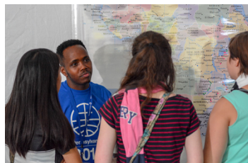
Learn about MWC's work.

Visit the fairground where people experience cultures represented in the global Anabaptist family. Learn our history, taste our food, participate in singing and dancing, listen to stories, or share your testimony!