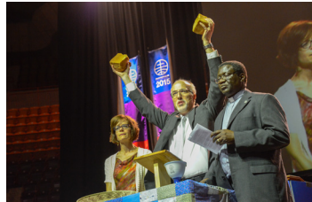
Global speakers.

For five days, be part of a multicultural worship experience that involves an international choir and ensemble, global speakers and a truly global communion. Apply to be part of the international choir on mwc-cmm.org/A17choir