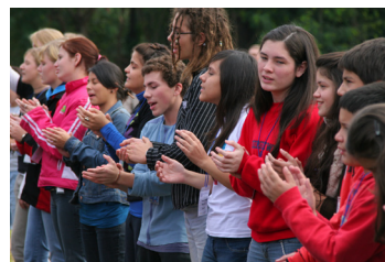
Special programs for children, teens and youth.

Young people will have a special focus during all parts of the Assembly. From exploring Biblical messages, inspiring music, Young Anabaptist speakers, sports to service opportunities, there will be tons of fun!