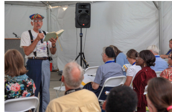
Attend a different workshop every day.

Assembly offers sharing and discussions in peace and justice, youth, creation care, baptism, interfaith dialog, creative ministry and more! Or submit another topic to mwc-cmm.org/A17workshops if you feel called to host a virtual or in-person workshop.